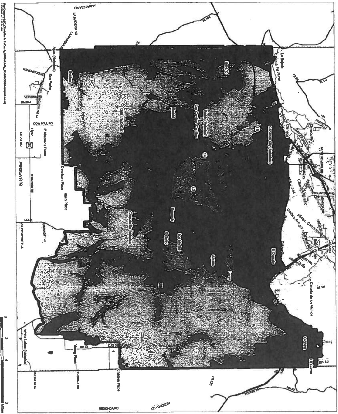
Exhibit B - Land and Environmental Suitability Analysis Map